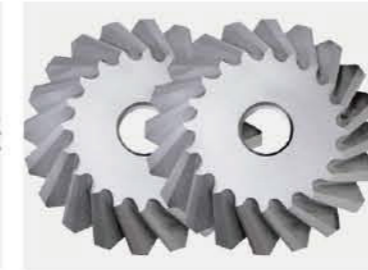
选配: 坡口锯片 Optional: beveling saw blade