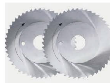
标配: 切割锯片 Standard: cutting blade

材质: M42 Material: M42 标配: 2把切割锯片 Standard: 2 pcs cutting blade 选配: 坡口锯片30°, 37°, 45° Optional: beveling saw blade 30°, 37°, 45°