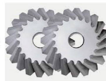
选配: 坡口锯片 Optional: beveling saw blade