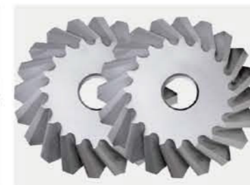
选配: 坡口锯片 Optional: beveling saw blade